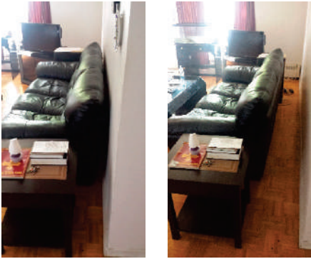
STEP 2 - FURNITURE AWAY FROM WALLS