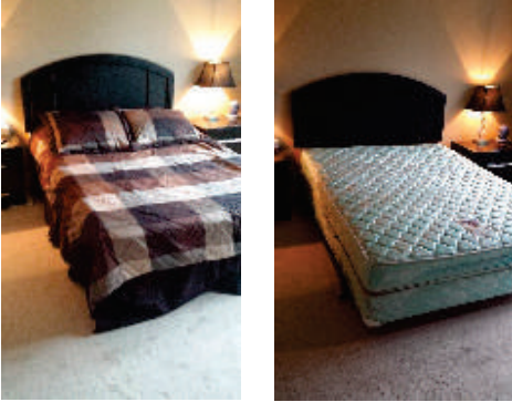
STEP 1 - BED PREP