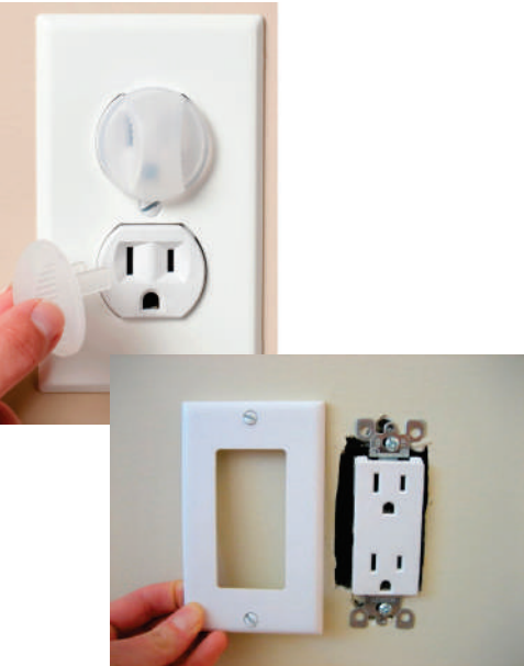
STEP 3 - REMOVE ALL OUTLET COVERS & SWITCHES