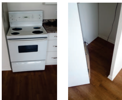
STEP 5 - CLEAN BEHIND STOVE