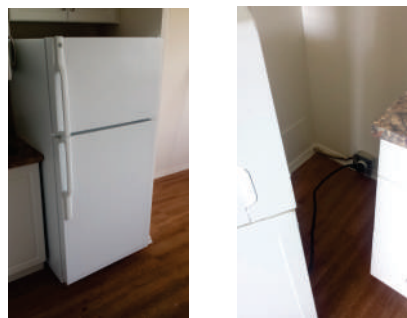
STEP 4 - CLEAN BEHIND FRIDGE