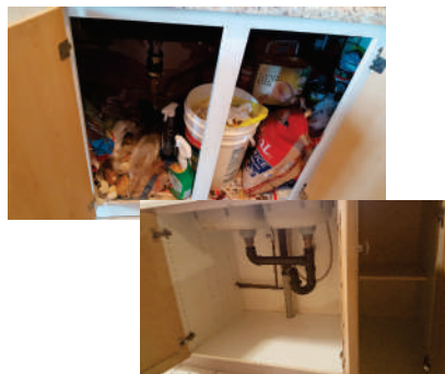
STEP 2 - LOWER CABINETS