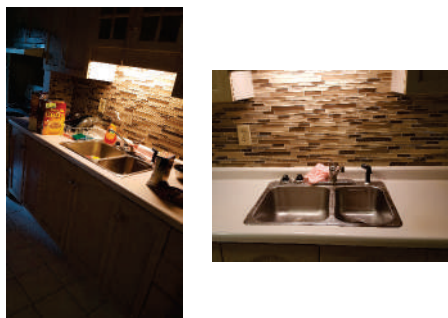
STEP 3 - COUNTER TOPS