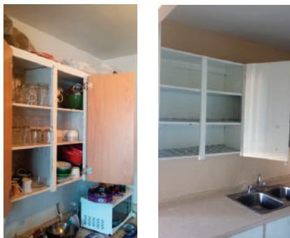
STEP 1 - UPPER CABINETS